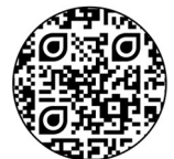
Bethany Land Trust Hike!